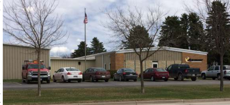
Harmony Enterprises, Inc.